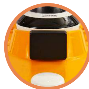
Millimeter Wave Radar