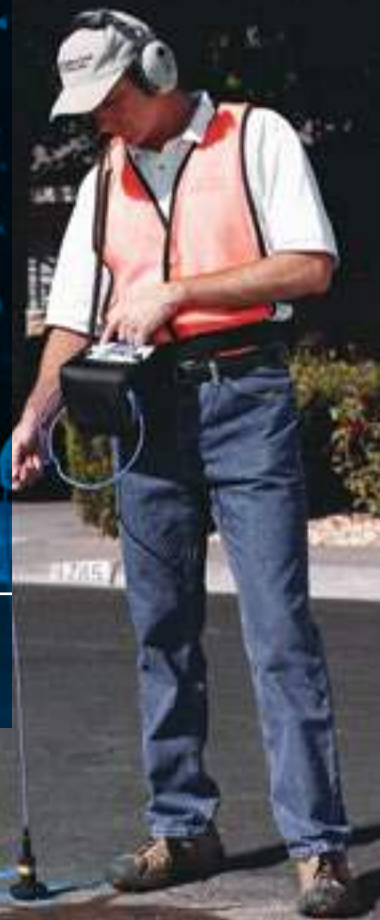
Pinpointing a water leak directly over the pipe