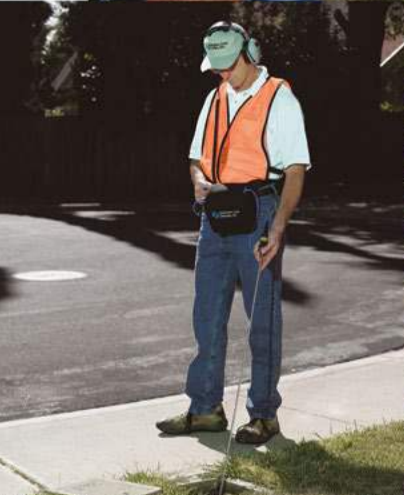
Surveying for water leak sounds at a meter