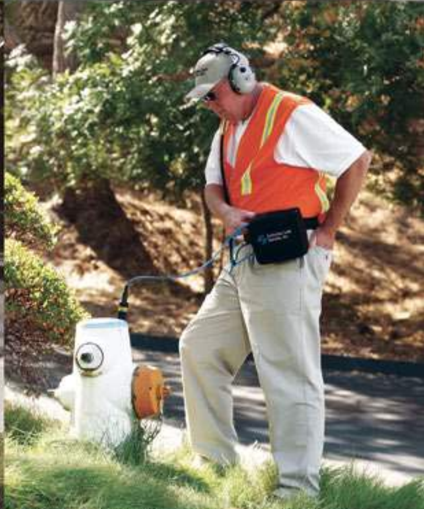
Surveying for water leak sounds at a hydrant