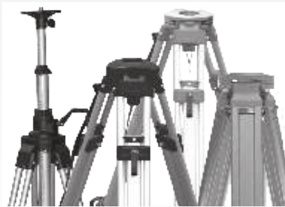
Full Range of Tripods to Fit Every Job