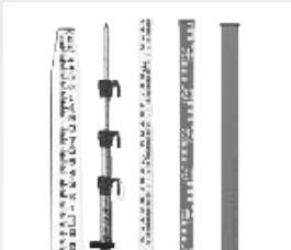
Full Range of Grade & Level Rods

Get the most out of the LT-800 with the combination CR-5 receiver with optional wireless remote, its both a machine mounted receiver and a rod mounted receiver.